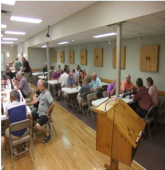
Pictured are only a few of the players that were involved with the Tournament.