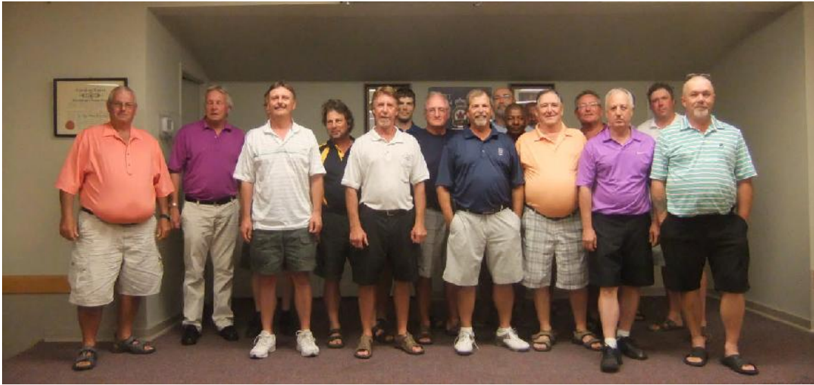
Pictured are the winning teams in the various categories. Congratulations to all Winners!!