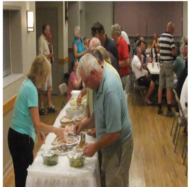
Lunch is served. Thanks to the Branch Ladies for such a wonderful table of goodies to indulge in.