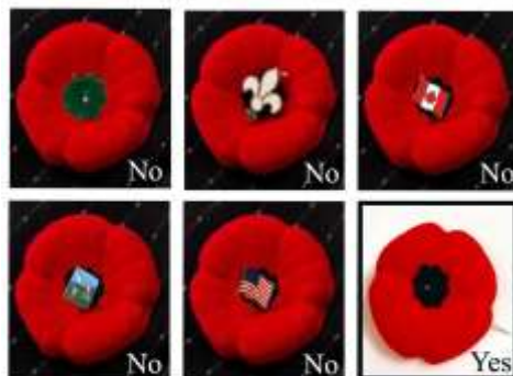
HOW TO WEAR THE REMEMBRANCE DAY POPPY

For further information please contact Bruce Poulin at Dominion Command, at (613) 591-3335 ext. 241 or by cell at (613) 292-8760 or bruce.poulin@legion.ca .