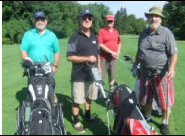
Thanks for joining us guys!