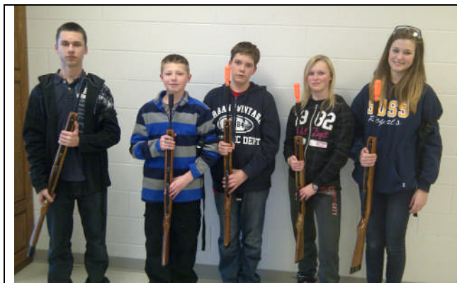
340 Squadron Zone Rifle Team 2013

While unable to place in the top three, the Cadets had an enjoyable time.