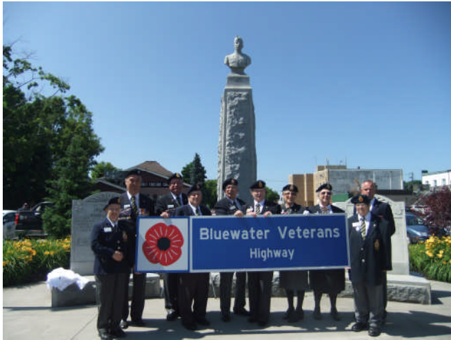
Zone Commanders & Branch Presidents